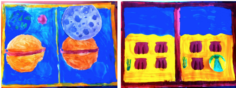
Pictures 2 and 3. Paintings by fifth-grade students from Slovenia, 2014/2015 school year.