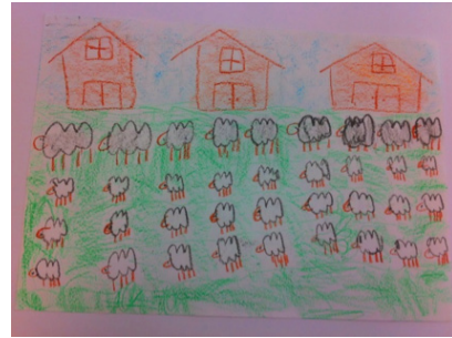
Pictures 4 and 5. Paintings by fifth-grade students from Slovenia, 2014/2015 school year.